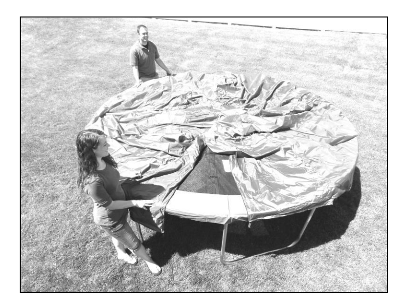
<u>Step 3 –</u> Unfold the Clubhouse. Find the entrance of the Clubhouse and align it with the enclosure entrance. Pull the Clubhouse over the entire enclosure, poles, and trampoline.

<u>Step 4 –</u> Lift each Enclosure Pole and Clubhouse upright. (Make sure the Curved Section of the enclosure pole is facing outward). Insert the bottom end of the Post into its corresponding T-Bracket Slot. This will allow the Enclosure and Clubhouse to be completely erected from ground level. DO NOT use any other method of assembly as it may result in personal injury and/or damage to the trampoline and clubhouse . Repeat this process for the remaining Upright Posts.