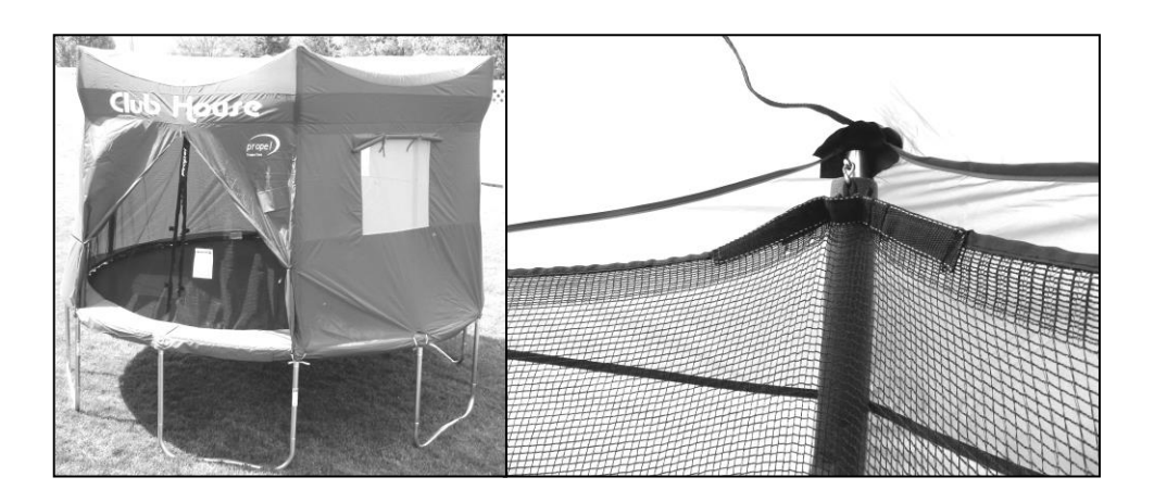
<u>Step 7 –</u> On the outside of the trampoline and Clubhouse tie each corner to the T-bracket and Leg directly below.

<u>Step 6 –</u> Open the entrance to the Clubhouse and Enclosure. Climb into the trampoline and align each corner of the Clubhouse to each enclosure pole.